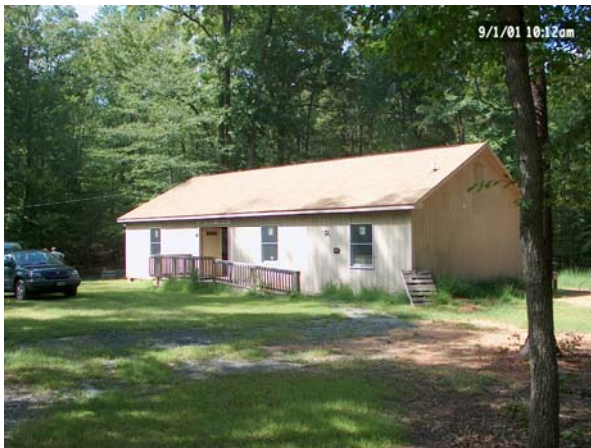
James Durant Meeting Hall