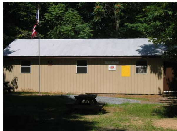
Herndon/Fauquier Host Cabin

Over the years youth groups, such as Boy Scouts, Cub Scouts, Girl Scouts, and church groups, have used the camp. Lions clubs have had picnics and overnight stays and shared lots of good fellowship. Boy Scout Eagle projects such as the Amphitheater, Orienteering Trail, Horseshoe pits, Maintenance building, bunk beds, and picnic tables have improved the camp.