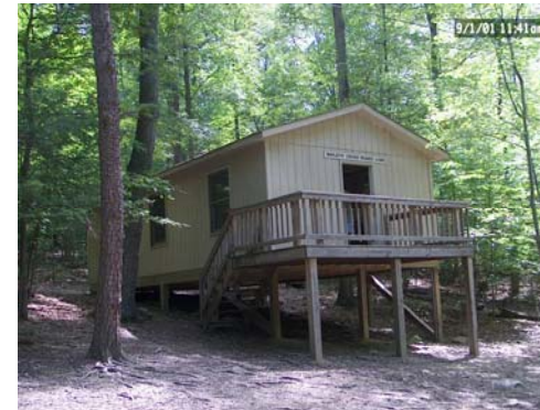
Baileys Cross Roads Cabin