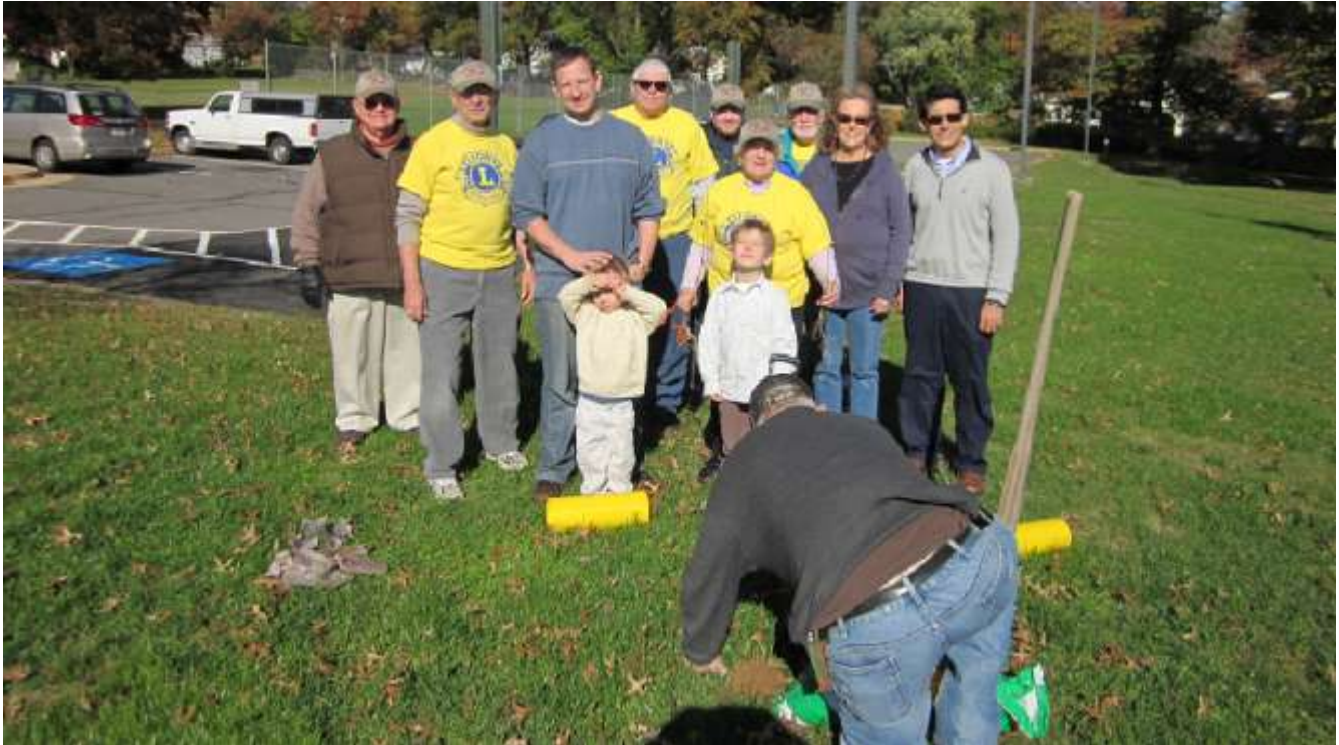
Tyson Corner Lions club held our tree planting on Sunday, November 6. Along with the Pimmit Hills Citizen Association, we planted 10 trees at Plmmit Hills School.