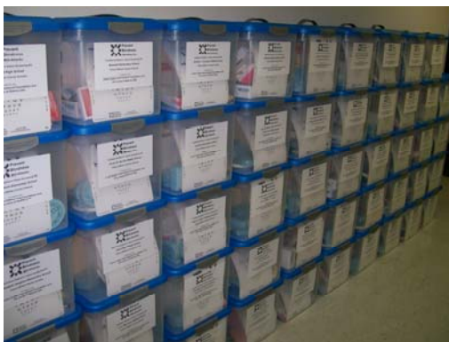
Prince William County Kits (a portion of)