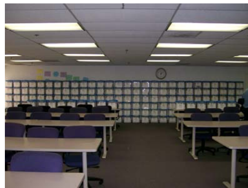
Fairfax County Kits (a portion of)